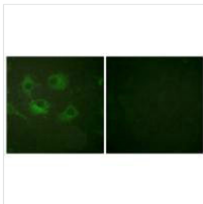
Immunofluorescence analysis of HuvEc cells, using Claudin 3 antibody.