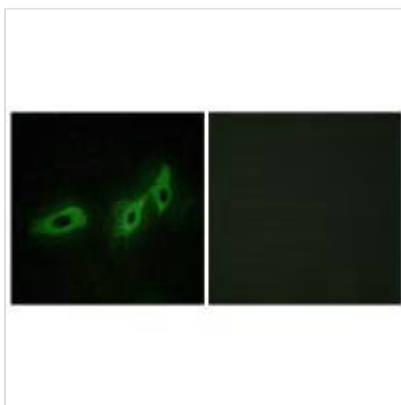
Immunofluorescence analysis of HeLa cells, using TRI18 antibody.