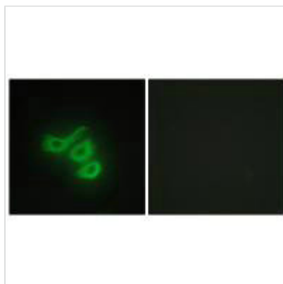
Immunofluorescence analysis of HepG2 cells, using M-CK antibody.