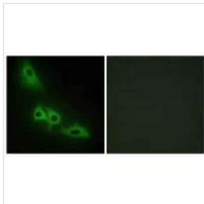
Immunofluorescence analysis of HeLa cells, using GLPK antibody.