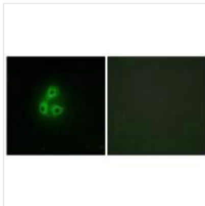
Immunofluorescence analysis of A549 cells, using CSK antibody.