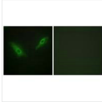
Immunofluorescence analysis of HeLa cells, using KP1/2 antibody.