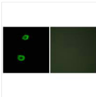
Immunofluorescence analysis of HepG2 cells, using LMTK2 antibody.