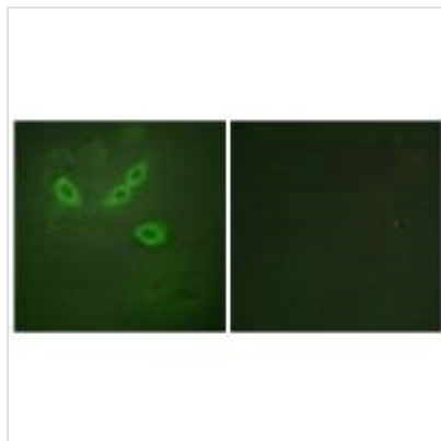
Immunofluorescence analysis of HeLa cells, using TUSC5 antibody.