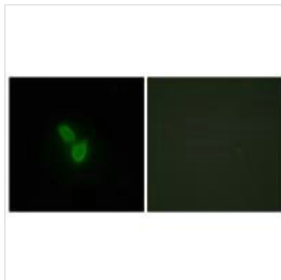
Immunofluorescence analysis of HepG2 cells, using PARD3 antibody.