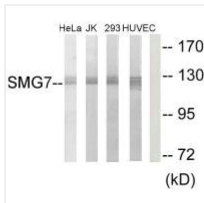
Western blot analysis of extracts from HeLa cells, Jurkat cells, 293 cells and HUVEC cells, using SMG7 antibody.