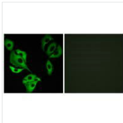
Immunofluorescence analysis of A549 cells, using ADCK4 antibody.