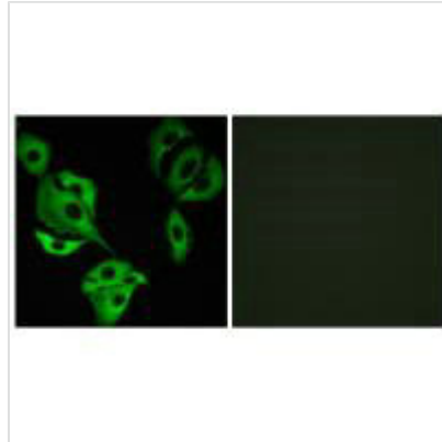
Immunofluorescence analysis of A549 cells, using ADCK4 antibody.