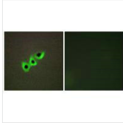
Immunofluorescence analysis of A549 cells, using RHG07 antibody.