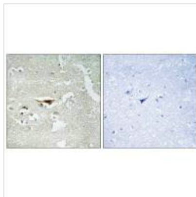
Immunohistochemistry analysis of paraffin-embedded human brain tissue, using IPKB antibody.