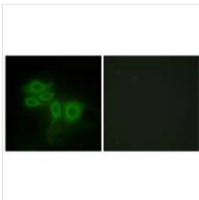
Immunofluorescence analysis of HepG2 cells, using SLK antibody.