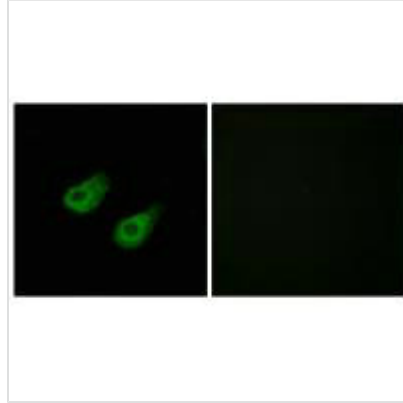
Immunofluorescence analysis of HeLa cells, using JIP3 antibody.