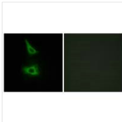
Immunofluorescence analysis of HeLa cells, using CDH17 antibody.