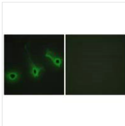
Immunofluorescence analysis of HeLa cells, using Collagen V \alpha 3 antibody.