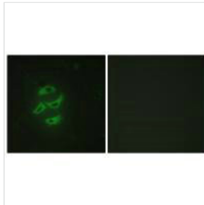
Immunofluorescence analysis of HepG2 cells, using Cytochrome P450 2J2 antibody.