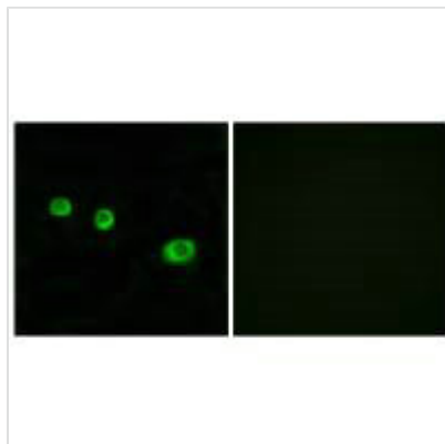
Immunofluorescence analysis of MCF-7 cells, using GBP1 antibody.