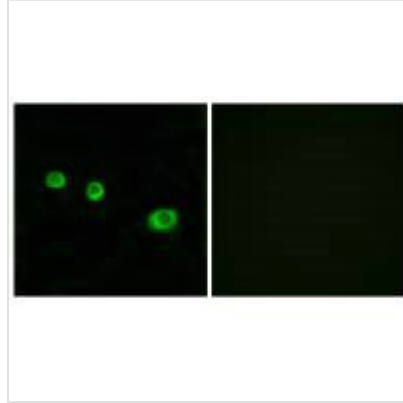
Immunofluorescence analysis of MCF-7 cells, using GBP1 antibody.