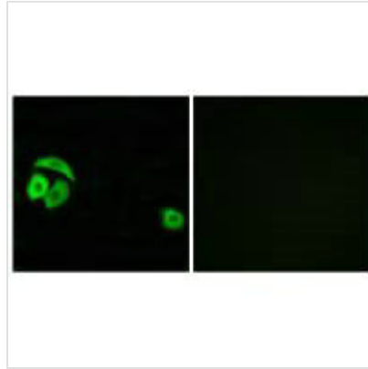
Immunofluorescence analysis of A549 cells, using RPL27A antibody.