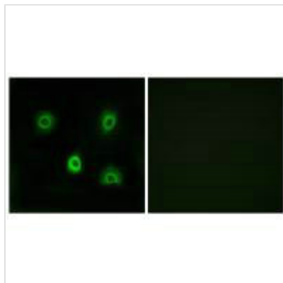
Immunofluorescence analysis of A549 cells, using ABHD6 antibody.