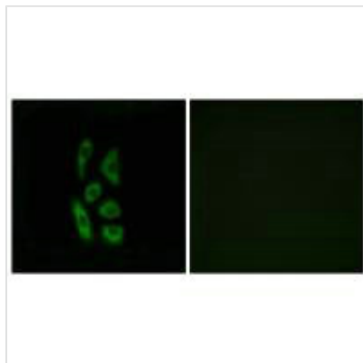
Immunofluorescence analysis of A549 cells, using ACOT12 antibody.