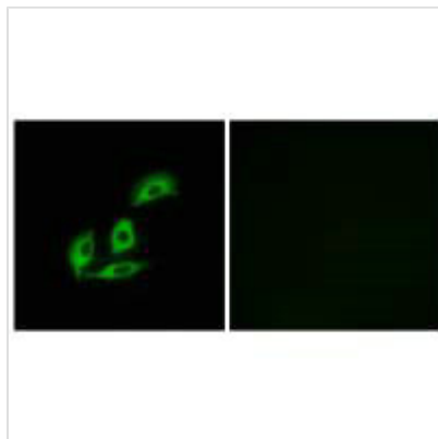
Immunofluorescence analysis of A549 cells, using NECAB3 antibody.