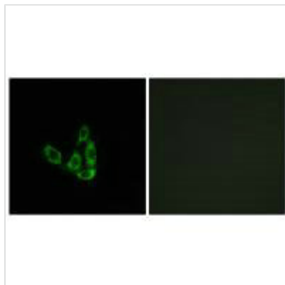
Immunofluorescence analysis of A549 cells, using GCNT3 antibody.