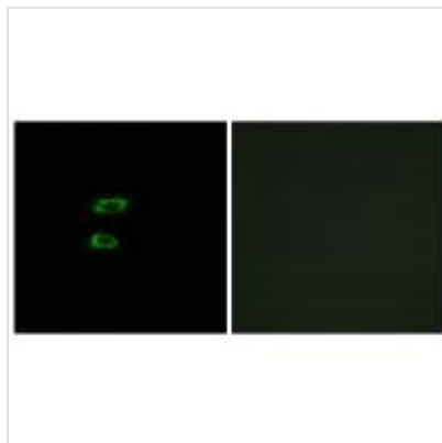
Immunofluorescence analysis of A549 cells, using BMP8A antibody.