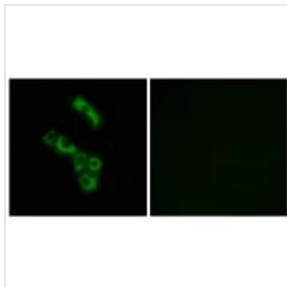
Immunofluorescence analysis of A549 cells, using C1QB antibody.