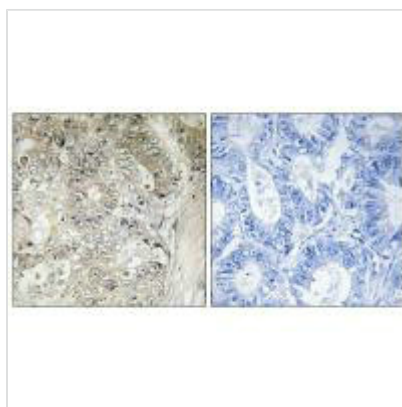
Immunohistochemistry analysis of paraffin-embedded human colon carcinoma tissue using CST1 antibody.