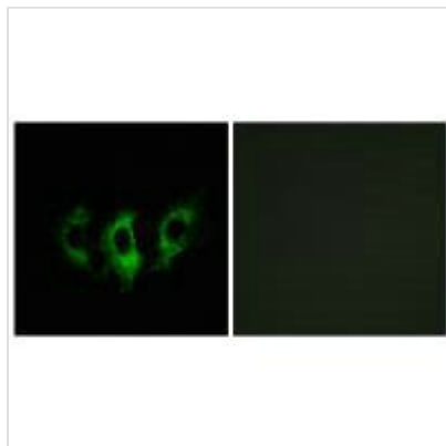
Immunofluorescence analysis of A549 cells, using GFM2 antibody.