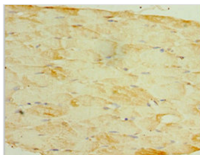
Immunohistochemistry of paraffin-embedded human skeletal muscle tissue using CSB-PA021097ESR2HU at dilution of 1:100