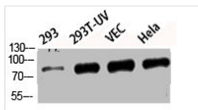
Western Blot analysis of 293 293T-UV VEC HELA cells using Phospho-Tau (S396) Polyclonal Antibody