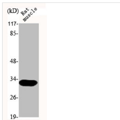
Western Blot analysis of RAT-MUSCLE cells using MOX-2 Polyclonal Antibody