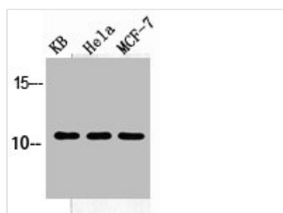
Western Blot analysis of KB HELA MCF-7 cells using SDF-1 Polyclonal Antibody