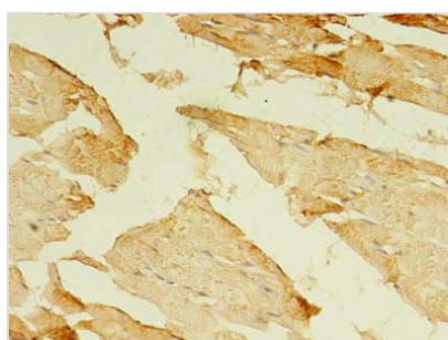
Immunohistochemistry of paraffin-embedded human skeletal muscle tissue using CSB-PA015301LA01HU at dilution of 1:100