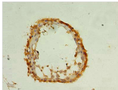
Immunohistochemistry of paraffin-embedded human testis tissue using CSB-PA761690LA01HU at dilution of 1:100