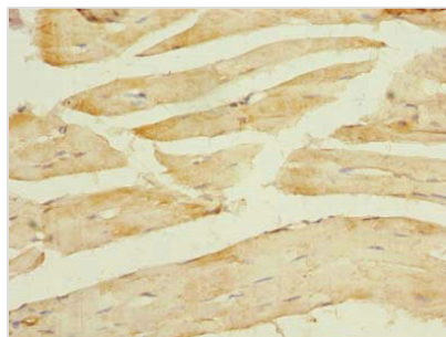
Immunohistochemistry of paraffin-embedded human skeletal muscle tissue using CSB-PA863109LA01HU at dilution of 1:100