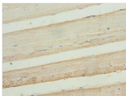
Immunohistochemistry of paraffin-embedded human skeletal muscle tissue using CSB-PA859521LA01HU at dilution of 1:100