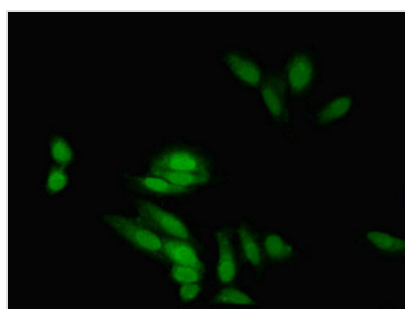
Immunofluorescent analysis of HeLa cells using CSB-PA872418LA01HU at dilution of 1:100 and Alexa Fluor 488-conjugated AffiniPure Goat Anti-Rabbit IgG(H+L)