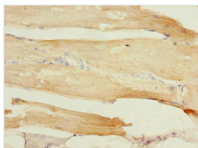
Immunohistochemistry of paraffin-embedded human skeletal muscle tissue using CSB-PA023264ESR1HU at dilution of 1:100