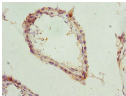
Immunohistochemistry of paraffin-embedded human testis tissue using CSB-PA024114ESR1HU at dilution of 1:100