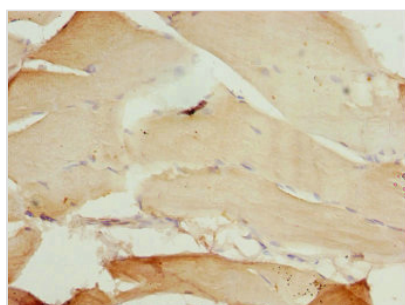
Immunohistochemistry of paraffin-embedded human skeletal muscle tissue using CSB-PA624027DSR1HU at dilution of 1:100