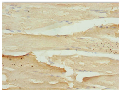
Immunohistochemistry of paraffin-embedded human skeletal muscle tissue using CSB-PA026322ESR2HU at dilution of 1:100