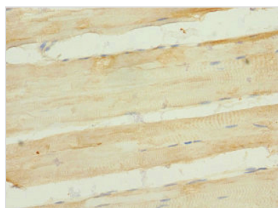
Immunohistochemistry of paraffin-embedded human skeletal muscle tissue using CSB-PA618796ESR1HU at dilution of 1:100