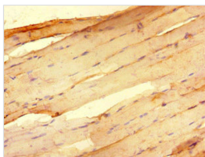
Immunohistochemistry of paraffin-embedded human skeletal muscle tissue using CSB-PA019889LA01HU at dilution of 1:100