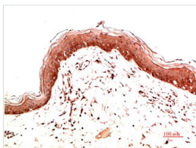
Immunohistochemical analysis of paraffin-embedded Human Skin Carcinoma Tissue using Collagen I Mouse mAb diluted at 1:200.