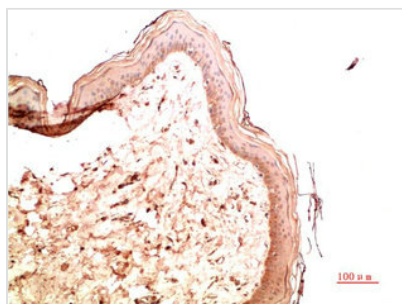
Immunohistochemical analysis of paraffin-embedded Human Skin Tissue using Collagen IV Mouse mAb diluted at 1:200.