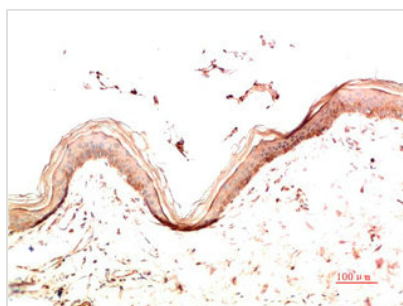
Immunohistochemical analysis of paraffin-embedded Human Skin Tissue using Collagen IV Mouse mAb diluted at 1:200.