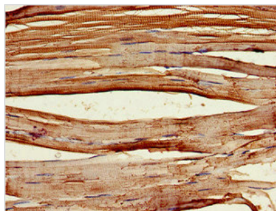
Immunohistochemistry of paraffin-embedded human skeletal muscle tissue using CSB-PA705514LA01HU at dilution of 1:100